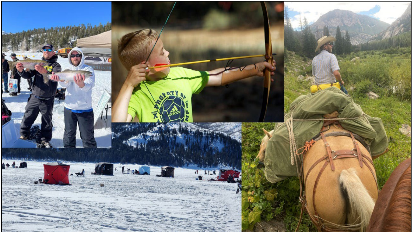
Photo 1. Example Recreation Activities at Vallecito Reservoir

Prepared by the Pine River Irrigation District in cooperation with the Bureau of Reclamation Western Colorado Area Office