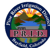
Figure 1. Pine River Project Recreational Amenities at Vallecito Reservoir

No warranty is made by the Bureau of Reclamation as to the accuracy, reliability, or completeness of these data. This project was developed through digital means and may be updated without notice. Map produced by Western Colorado Area Office, Bureau of Reclamation. Map updated 6/28/2023. C:\Users\shatch\Documents\ArcGIS\Projects\Pine River Recreation Management Plan